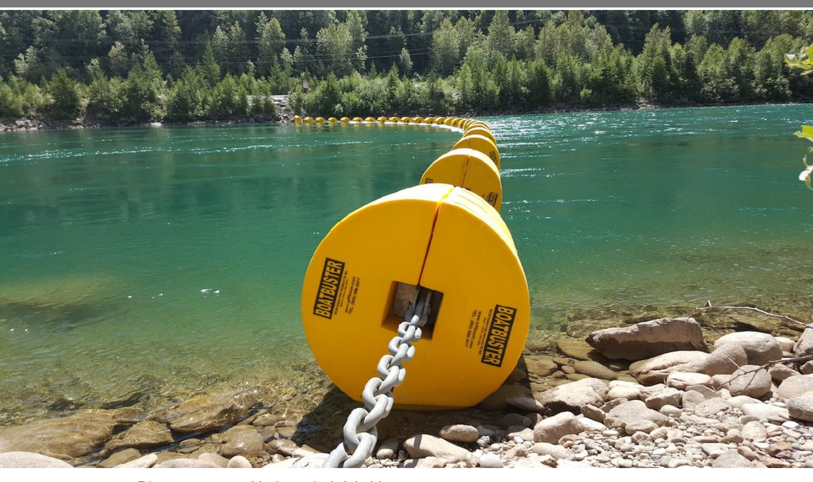
Discover more with these helpful videos (click to play in YouTube - https://www.youtube.com/c/Tuffboom)