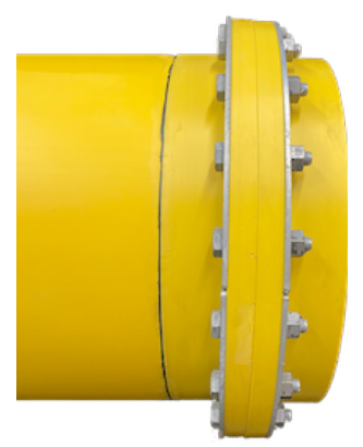
Flanged end showing flange to flange end connection.

ODINBoom can be designed with flanged ends or in a flangeless design using a solid end cap. When the designed with flanged ends, the units can be connected flange end to flange end or furnished with an engineered steel end plate for connection utilizing chain.