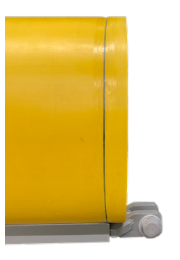
Flangeless end cap showing bottom steel channel.